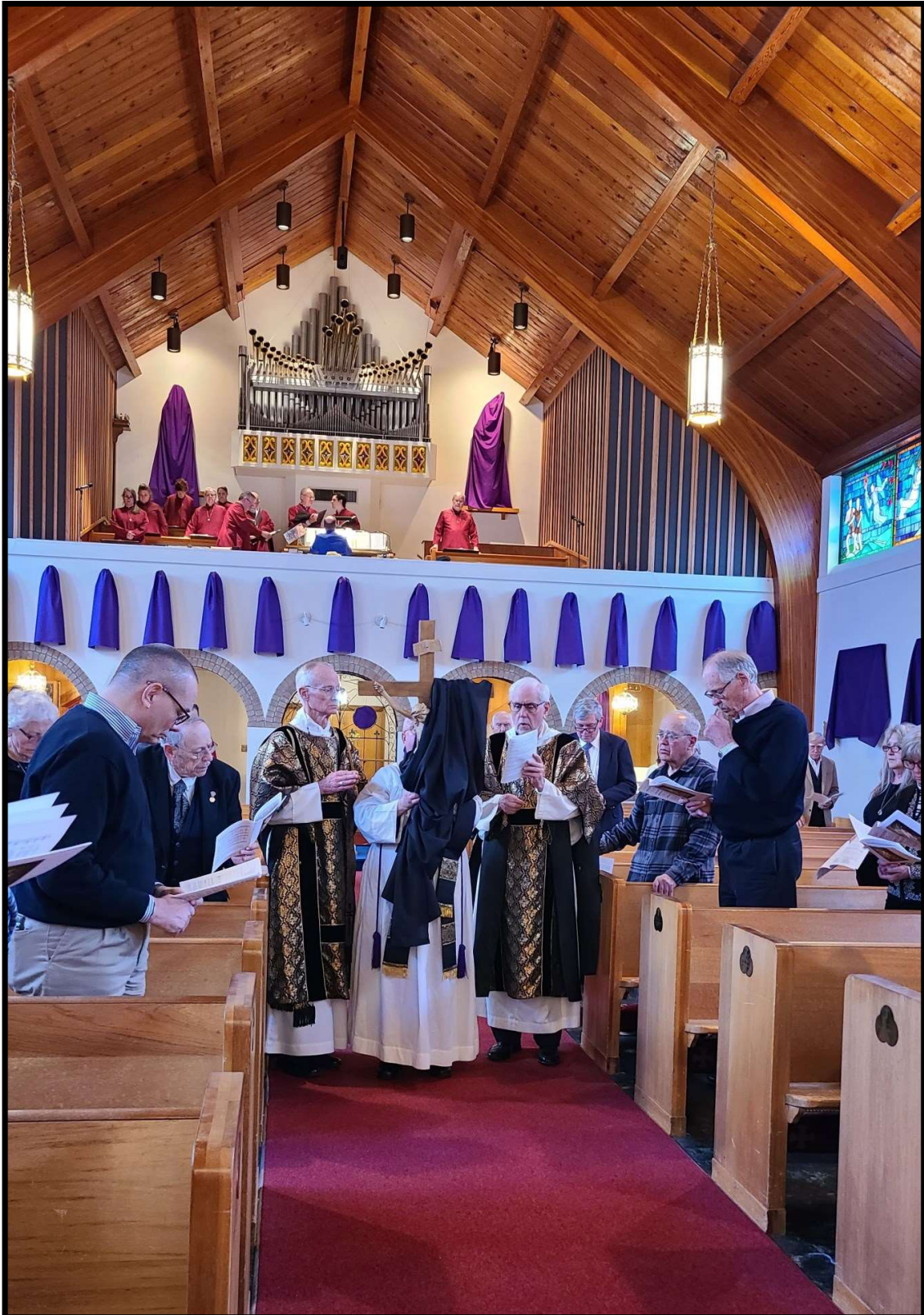
The Good Friday liturgy was marked by the Veneration of the Holy Cross (pictured above) as well as the Solemn Collects and Holy Communion using the Pre-Sanctified hosts that had been venerated overnight by parishioners at the Altar of Repose in the Lady Chapel .